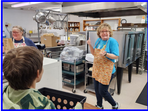
The 6th Grade delivers treats to the kitchen

National Random Acts of Kindness Day was February 17th, 2023. To celebrate, the 6th-grade students delivered bags of “kindness” filled with treats school-wide to the staff. Fun was had by all!