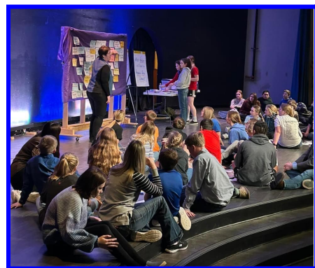
Students fill the bulletin board with their ideas.