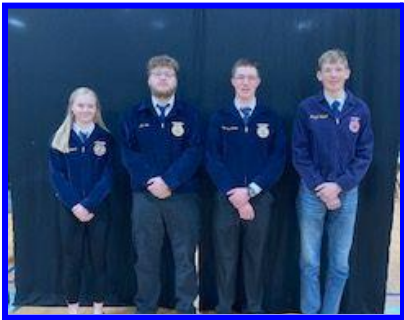
Biotechnology Team Members