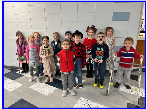
The Kindergarten Class dressed up for the 100th day of school.

We are glad that the little kids had a great time celebrating in different ways. We have wonderful teachers who help make school a fun place to be.