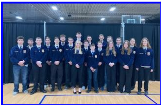
Hyannis FFA Chapter Members