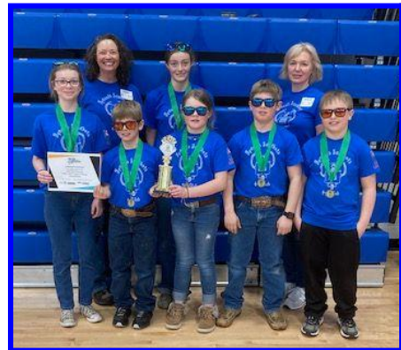
The robotics team with their trophy