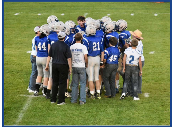
The Longhorn Football team huddles before playing the Mullen Broncos on Homecoming Night.

We would like to wish the Longhorn Football team good luck for the remainder of their season!